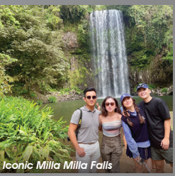
Leonic Milla Milla Falls