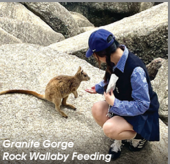
Granite Gorge Rock Wallaby Feeding