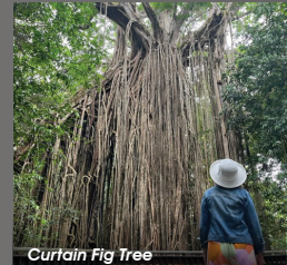
Curtain Fig Tree