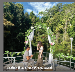
Lake Barrine Proposal