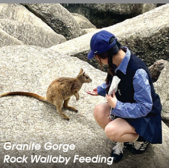
Granite Gorge Rock Wallaby Feeding