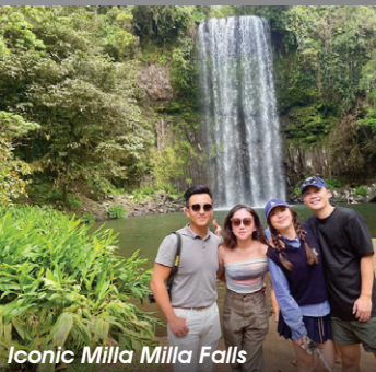
Iconic Milla Milla Falls