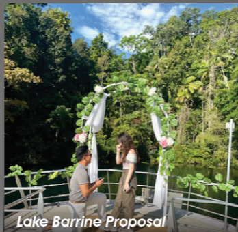
Lake Barrine Proposal